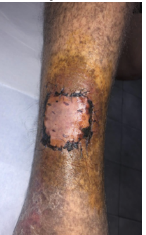
Fig. 3. The eighth day post skin grafting after coverage with silver dressing

in the absence of residue [13]. Dressing of the study group was changed notably more comfortably. The skin grafts were totally integrated after 10-12 days. Negative pressure wound therapy with polyurethane foam can be used on the skin grafs that are covered with silver dressing [14].